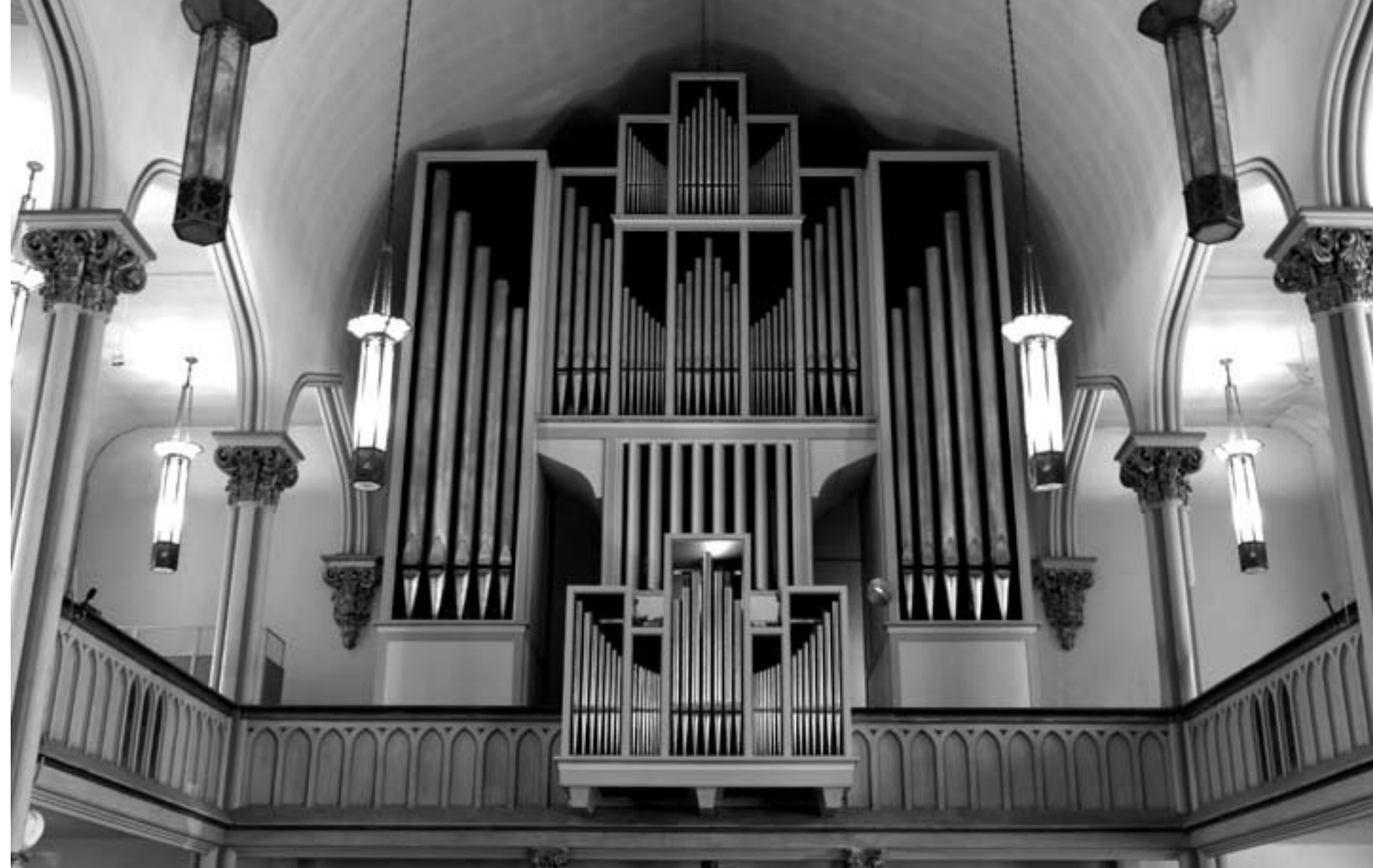
A partial array of the Beckerath organ's 3,467 pipes as seen from the church floor.